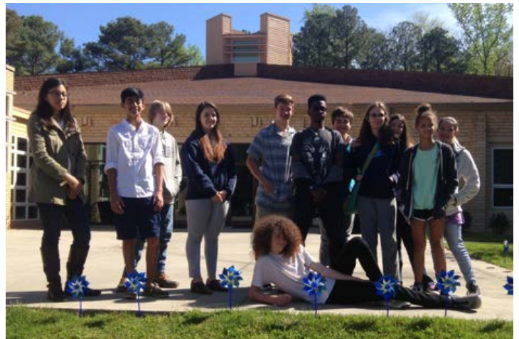
UUCA and AUUF teens on April 9, 2017

Assured, however, of this passing Neither turns ‘round, nor looks back; The future, somehow, still beckons, Nods and waves.